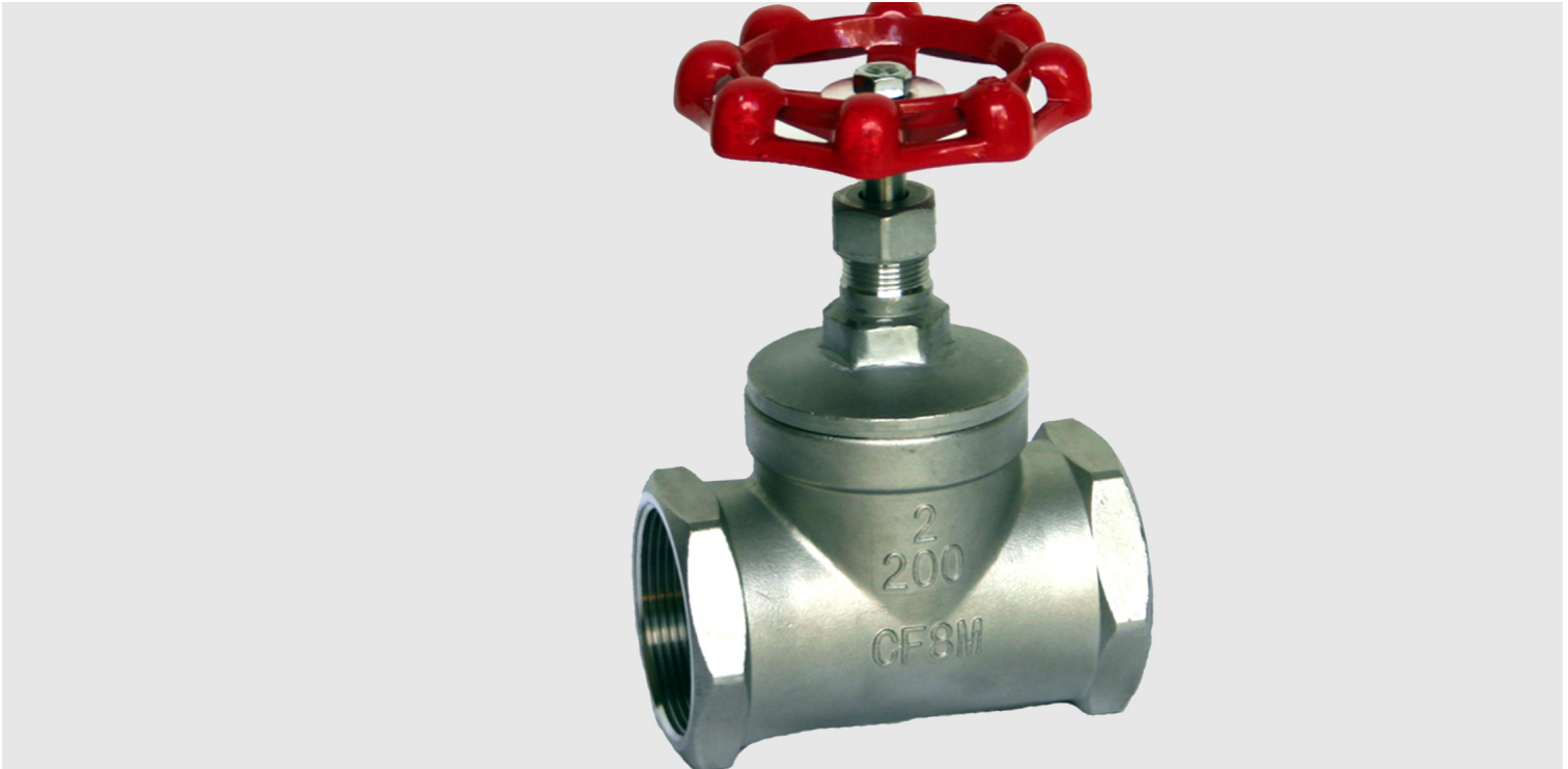
Figure # 41276 = 200#, 316, NPT, Globe Valve